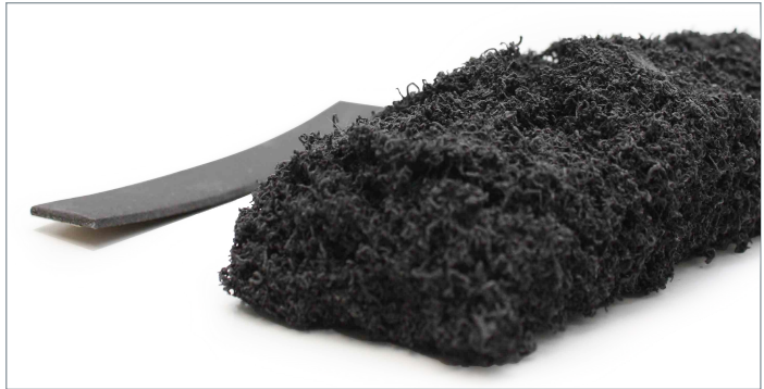
FLEXILODICE before and after exposure to fire.

The microporous layer formed during expansion prevents the passage of any flames, smoke or hot gases.